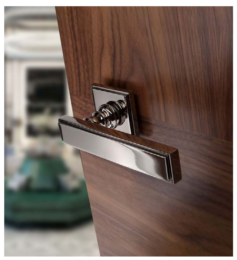
POWERCOAT POLISHED NICKEL