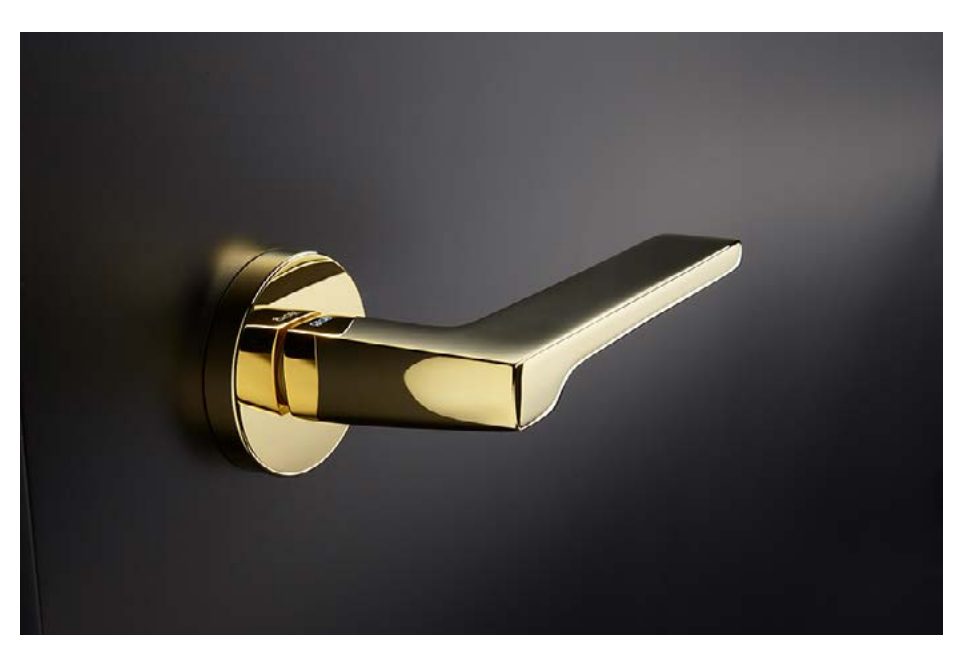
POWERCOAT POLISHED BRASS