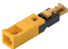
12V: Loox5 socket/Loox plug