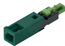
24V: Loox5 socket/Loox plug