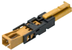
12V: Loox socket/Loox5 plug