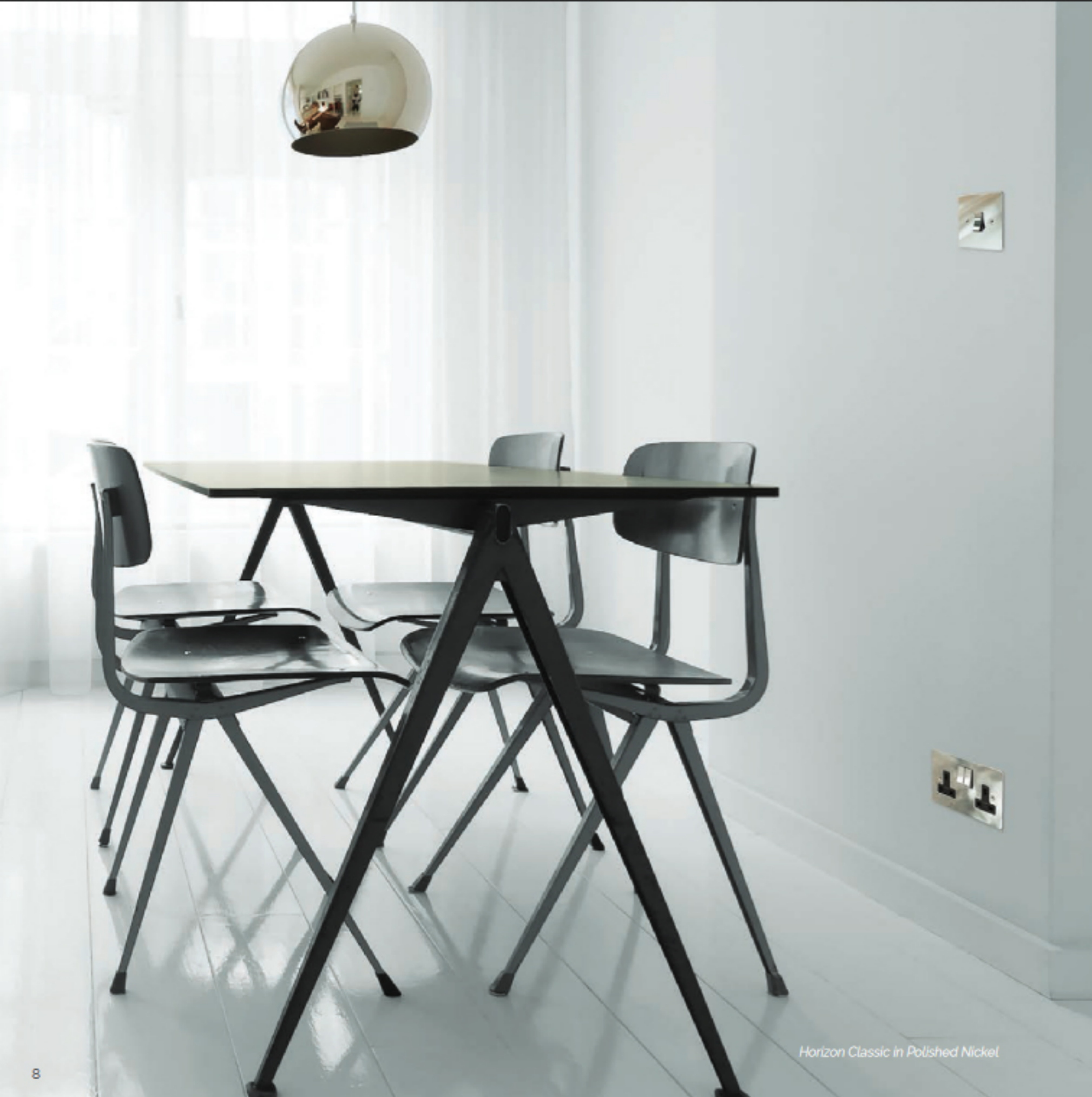
Horizon Classic in Polished Nickel