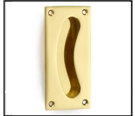
Kidney Cast Flush Pull 2136

Dimensions: Other sizes available are below: